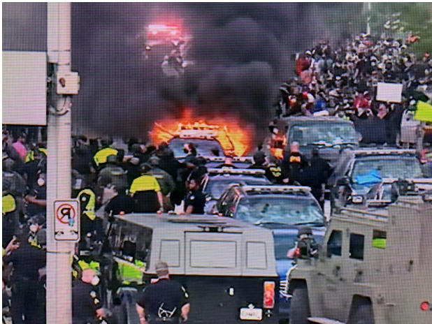
City of Atlanta