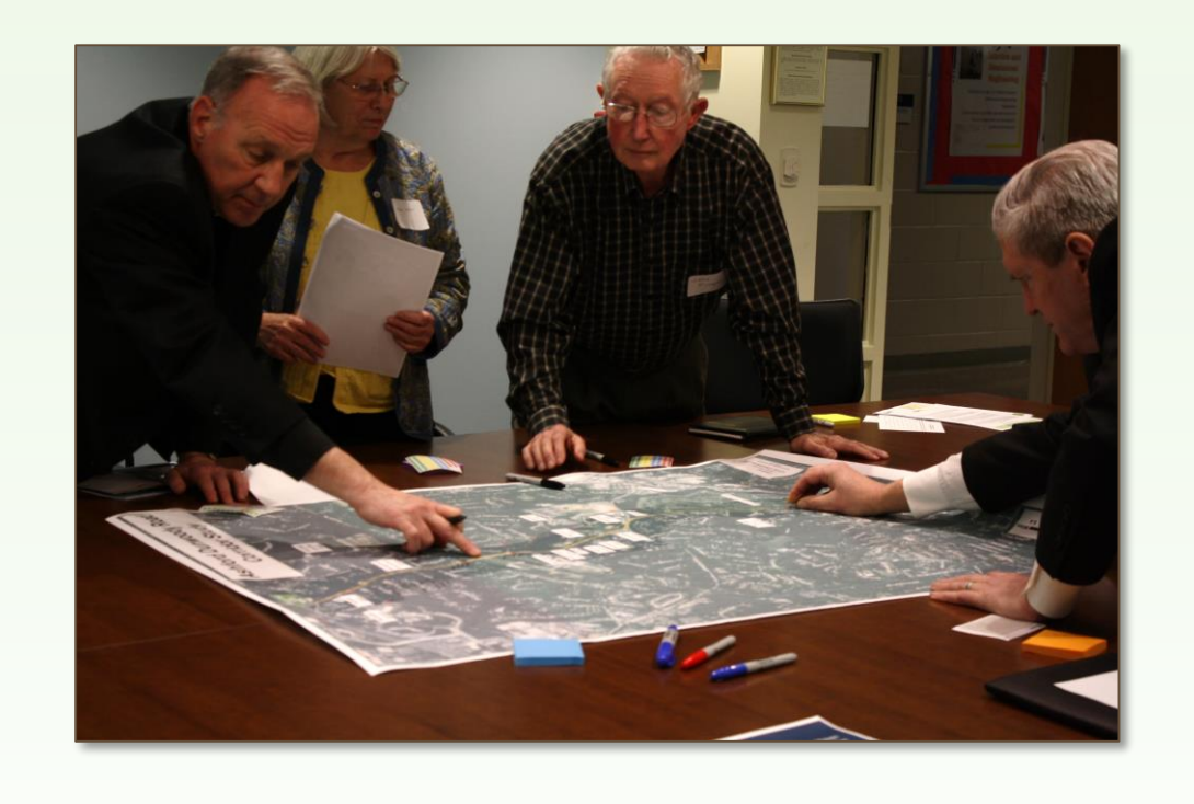
Please keep an eye out for information about the upcoming community charrette!