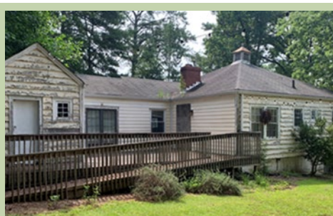
To make room for the parking lot expansion, the MCP Scout Hut was demolished in May 2022.

Scan QR code to view Open House presentation.