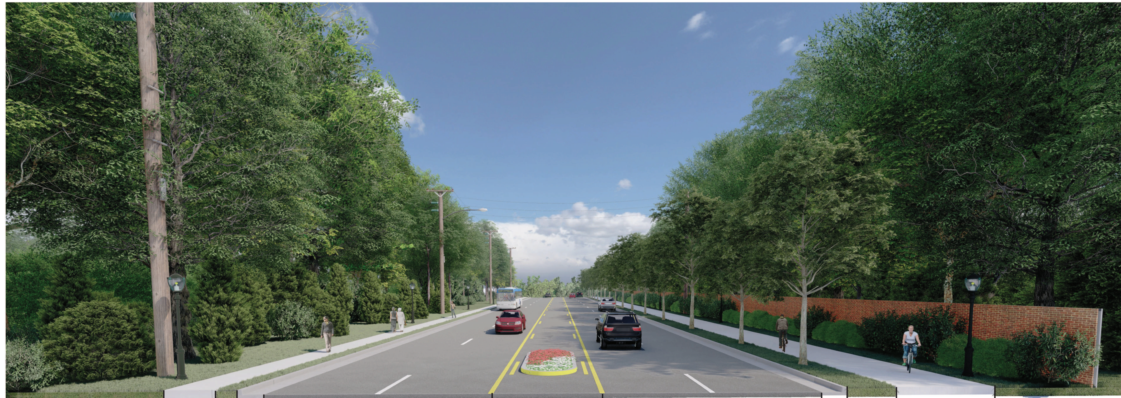
View Facing North

First Public Open House - January 14 & 16, 2019