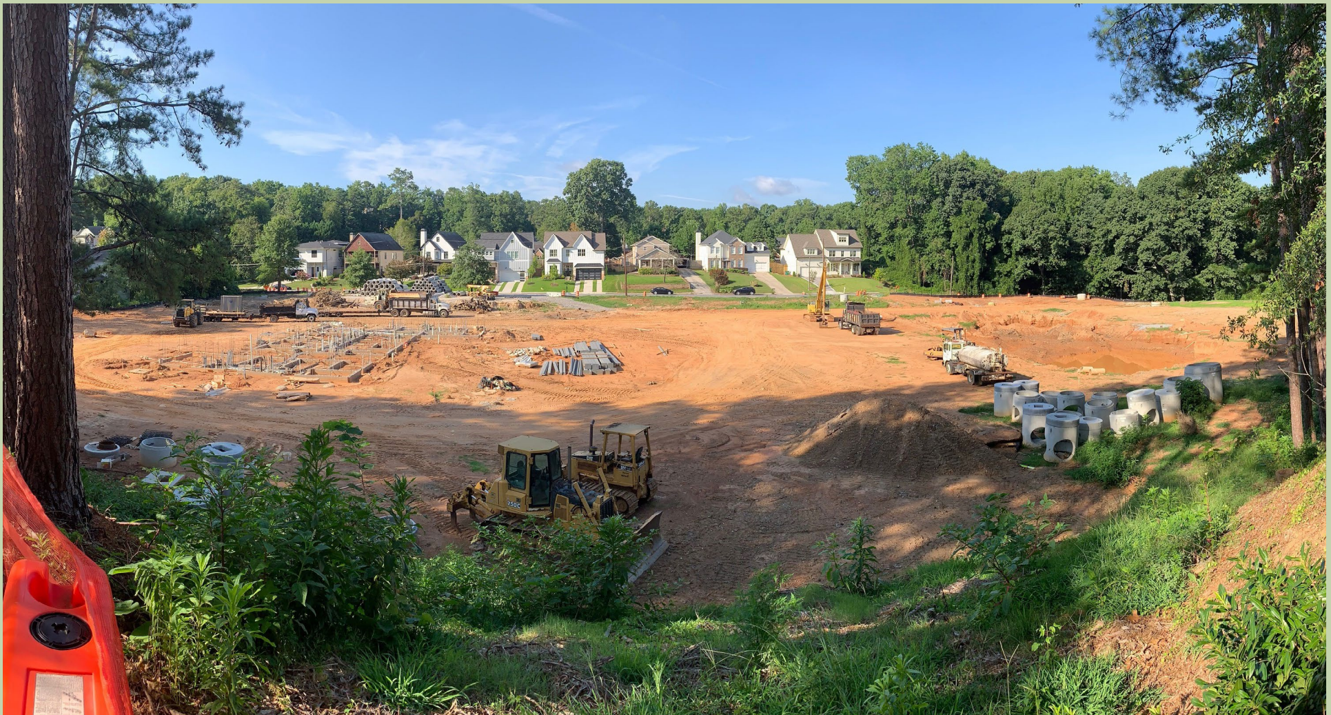
Site of City's newest pool facilities at Lynwood Park

Excavation for underground stormwater detention has started and will set the stage for the grading necessary to install the synthetic turf field. The turf field will be installed once this is complete and is expected to be ready for use in Spring 2023.