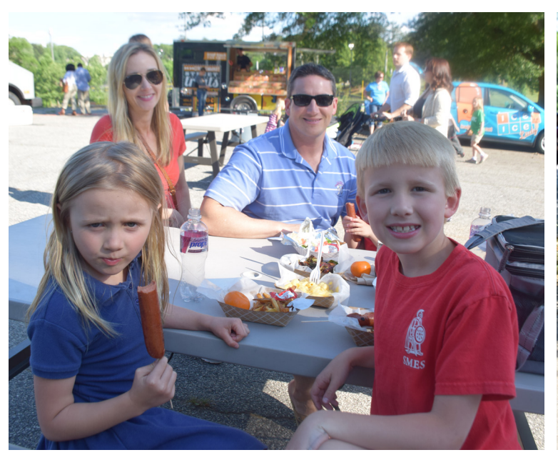
Food trucks returned to Blackburn Park in May and continue every Wednesday through Sept. 28. The Lynwood Park Community Day in May continued a decades-long tradition.